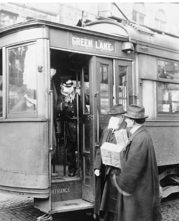
A street car conductor in Seattle in 1918 refusing to allow passengers aboard who are not wearing masks

But even before 1918, or any of the other world-altering epidemics of the previous centuries, our entire world has been infected with a different kind of virus. This virus cannot be stopped by social distancing, for it is a spiritual disease—passed down to us from our planet’s first parents, Adam and Eve.