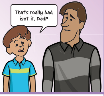
It is bad, son. But God sent Jesus. Jesus died on the Cross to take the punishment for sins. He gives eternal life to all who trust in Him.